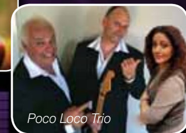
Poco Loco Trio